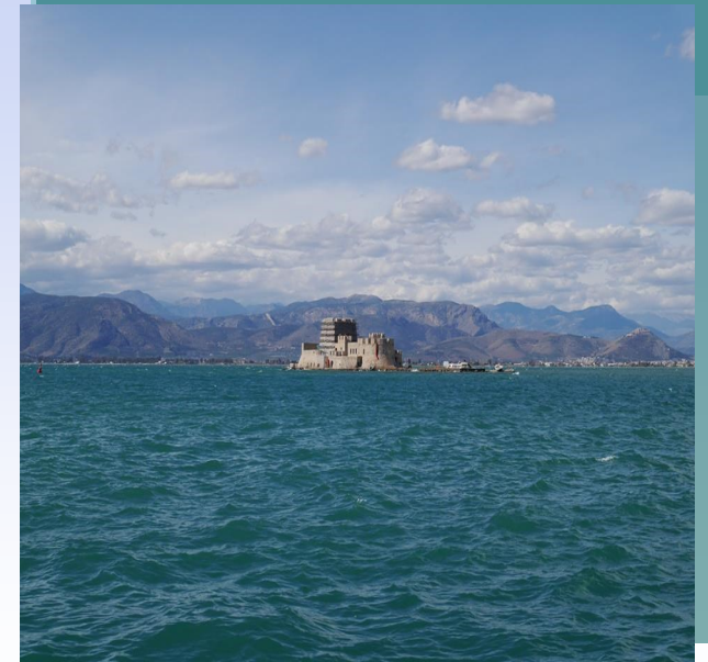
The small fortress Bourtzi

Next stop: the Palamidi Castle proudly standing 216 m above sea level. In order to reach it you have to climb all of its 999 steps carved into the rock! The view is totally rewarding!